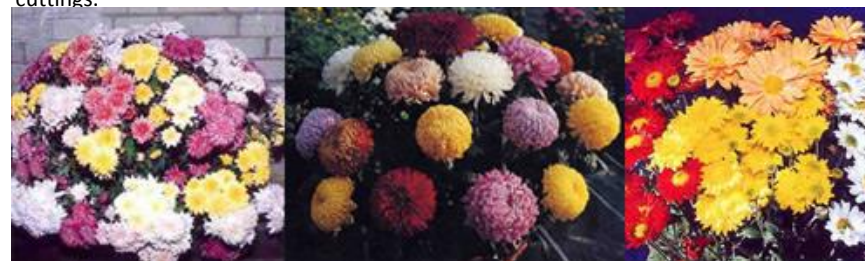
Typical displays from some of our collections AVAILABLE EARLY FEBRUARY

Anyone not familiar with varieties should take advantage of the following collections which is a full comprehensive list. Just state when you want to flower them and the time you wish to receive the cuttings.